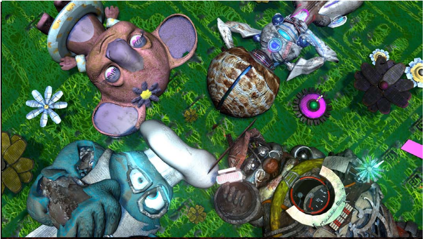
The Energy Heroes of Sky Island count the clouds in the sky

(High Resolution Images available upon request)