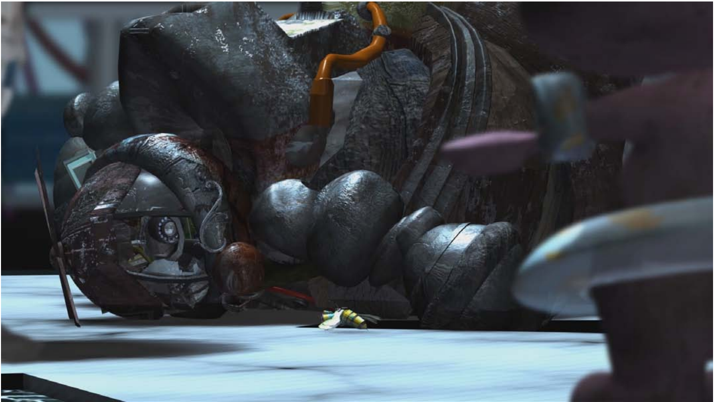
Jukebox, exhausted from searching for energy, takes a deserved rest

(High Resolution Images available upon request)